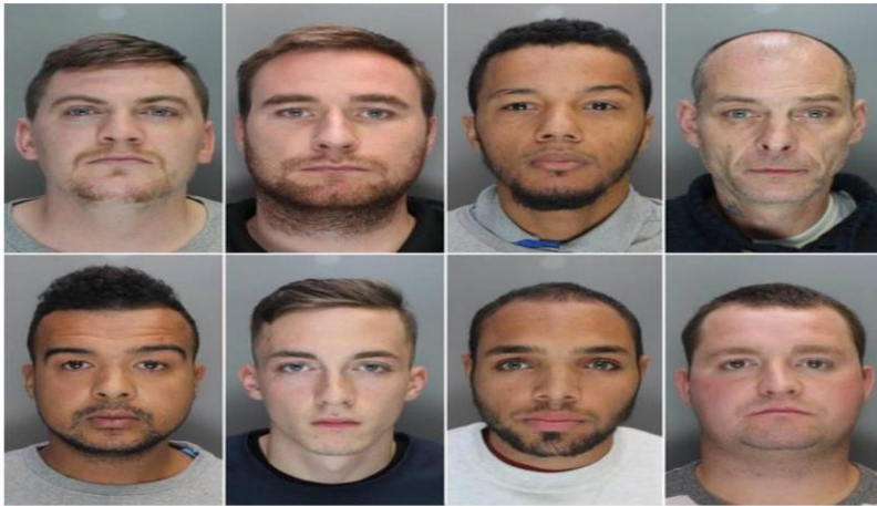
GANG: The hooligans were sentenced today