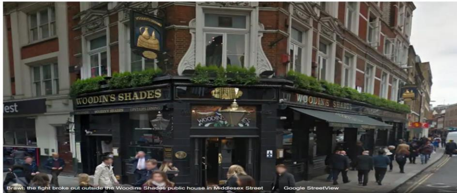
Brawl: the fight broke out outside the Woodins Shades public house in Middlesex Street